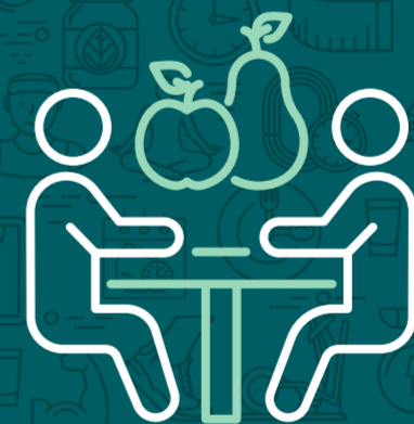
Health Eating & Lifestyle Advice