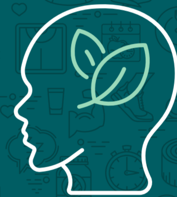
Mental Health Promotion