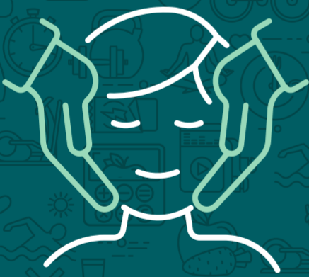
Stress Relieving Massage