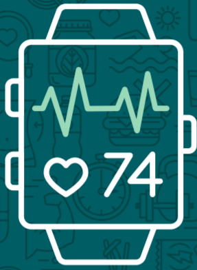
Blood Pressure Check