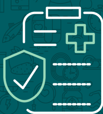
Health Check Point